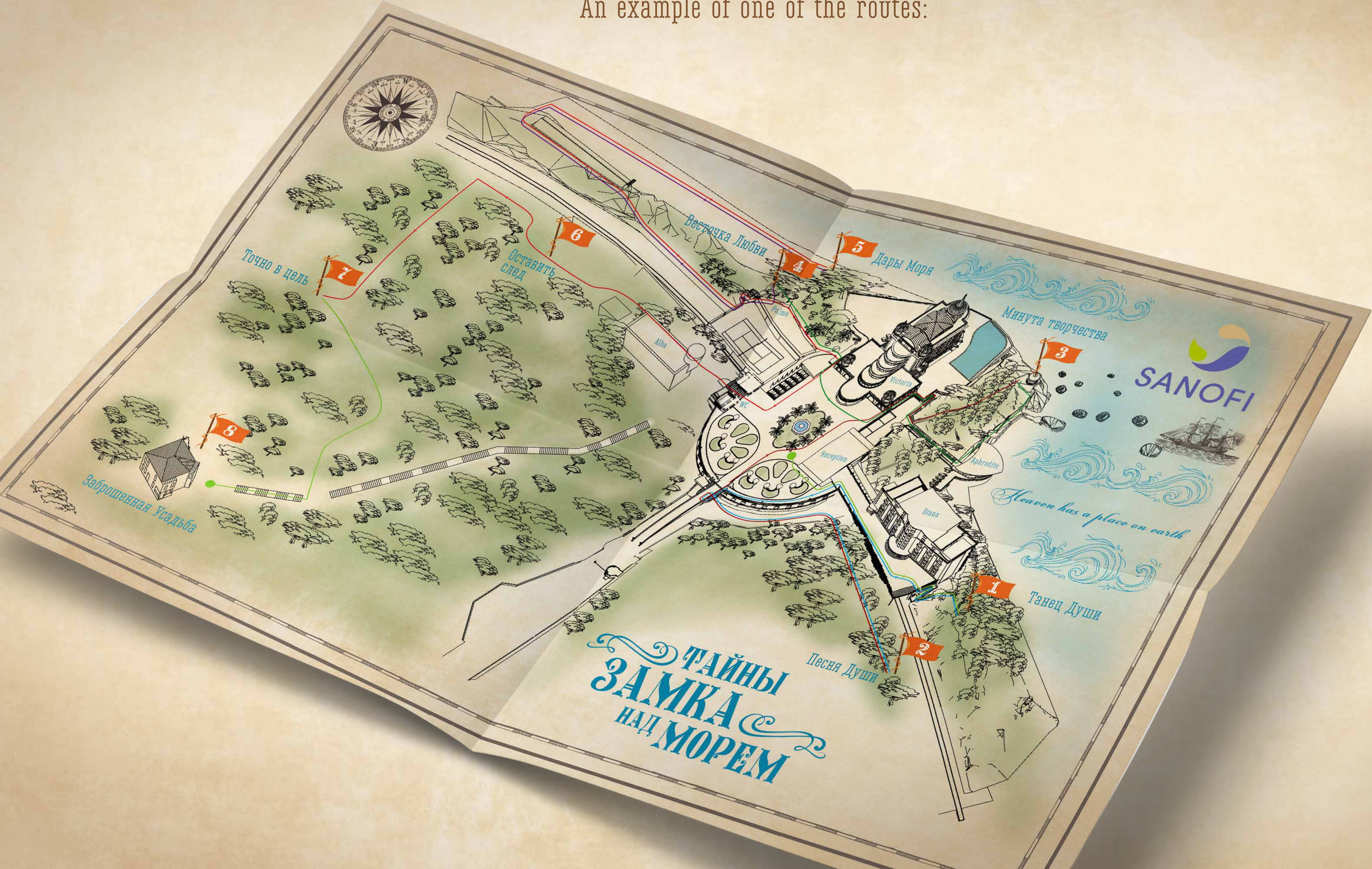
An example of one of the routes: