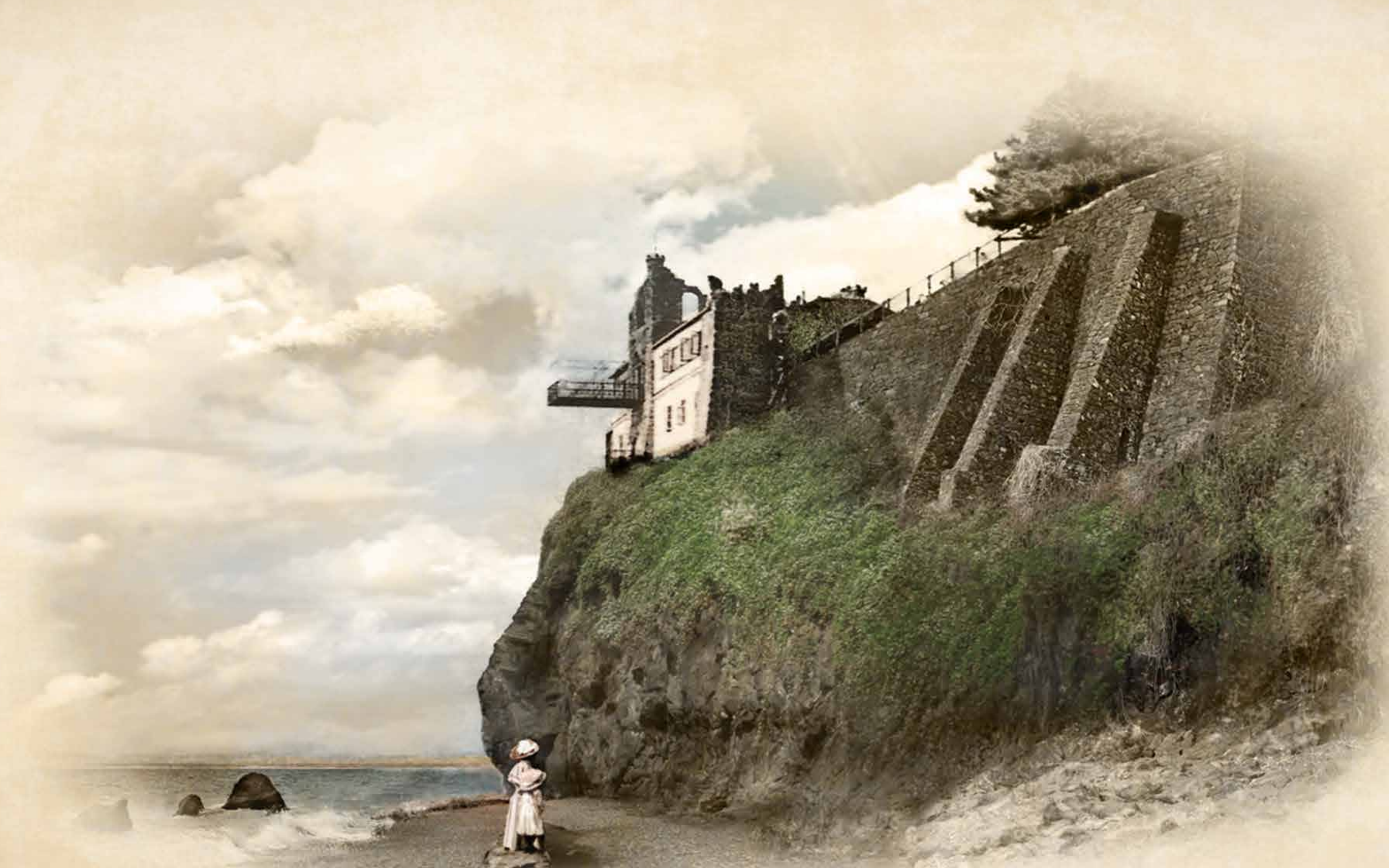
Mysteries of the Castle over the sea